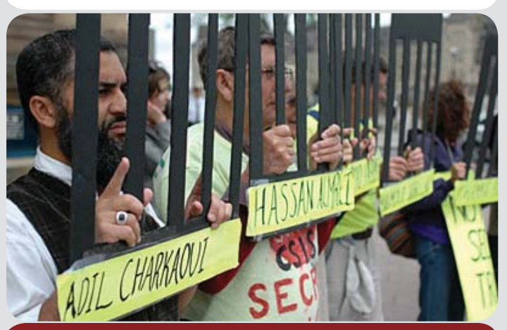
Opponents of security certificates at the Supreme Court hearings in Ottawa.